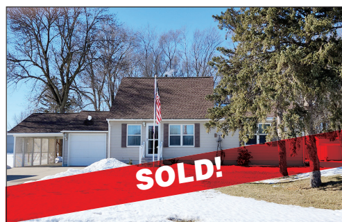
26269 STATE HIGHWAY 218 • AUSTIN $209,900 MLS#6331032

This twin home has everything you need on the main floor and top notch finishings throughout. Main floor amenities include a master bedroom with private bath, laundry room, 1/2 bath, open kitchen and living room with patio doors to the backyard patio. Open floor plan with vaulted ceilings. Kitchen has a center island & granite counter tops. Second floor has a 2nd and 3rd bedroom and a full bathroom. Located on a quiet cul-de-sac this is a new home with a lot to offer!