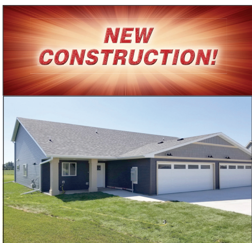
921 3RD AVE SE • HAYFIELD $274,900 MLS#6236897

A spacious, one level 3 bedroom 3 bath home in a great small town neighborhood. Open floor plan with living room, dining room, kitchen, & family room. Master bedroom with private bath. Main floor laundry. Attached 3 car garage with in floor heat. Patio and decks overlooking a landscaped yard. This is a great low maintenance home!