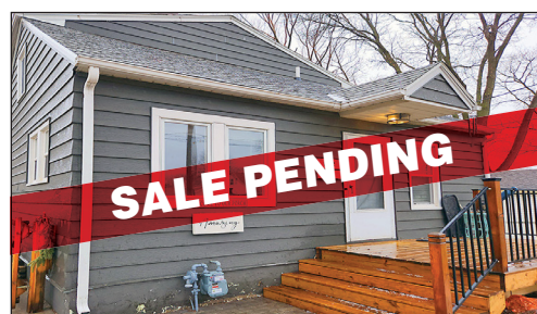
1512 4th Street NE • Rochester $239,900 • MLS #6350575

Spacious 3 bedroom 2 bath ranch style home. Open floor-plan. Kitchen with center island. Big dining and living area. Main floor laundry. Small deck in front, large deck & patio in the backyard. Heated 2-car attached garage. Basement has some framing, wiring & sheetrocking done and could add a lot of finished living space for the right buyer!