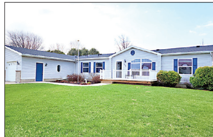
605 4TH STREET NW • HAYFIELD $189,900 MLS#6359262

A spacious, one level 3 bedroom 3 bath home in a great small town neighborhood. Open floor plan with living room, dining room, kitchen, & family room. Master bedroom with private bath. Main floor laundry. Attached 3 car garage with in floor heat. Patio and decks overlooking a landscaped yard. This is a great low maintenance home!