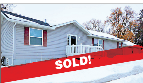
215 2nd Ave NE • Hayfield $229,900 • MLS #6336708

This home has been meticulously maintained & is ready for you to move in! Living room & dining room are very spacious. Nice custom cabinetry in the kitchen which has a door to a fabulous screened in deck overlooking a woody backyard. Huge main floor bedroom and a den. Upstairs has a large foyer area. There is a one car attached garage & a big 2 car detached garage that is heated. Never lose power with the Generac Generator. This property has a lot to offer!